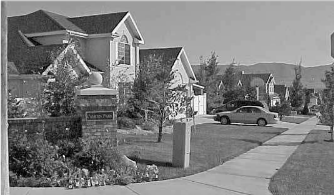
Some of the attractive homes that are near the Harmon's store. The Draper City Council had to grapple with the decision of what kind of commercial uses are compatible with Draper residential areas and how adjoining uses can be buffered.

"It is a legislative body's prerogative to determine public policy, a judicial body's job to interpret the policy, and an administrative body's job to enforce the policy. Establishing zoning classifications reflects a legislative policy decision with which courts will not interfere except in the most extreme cases. Indeed, we have found no Utah case,